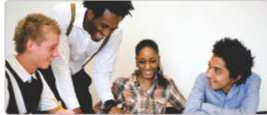
SED EDUCATORS ENHANCEMENT PROGRAMME