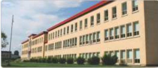
SED SCHOOL INFRASTRUCTURE ENHANCEMENT PROGRAMME